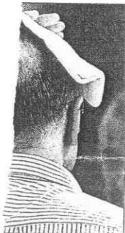
Mercury remained at temperature was